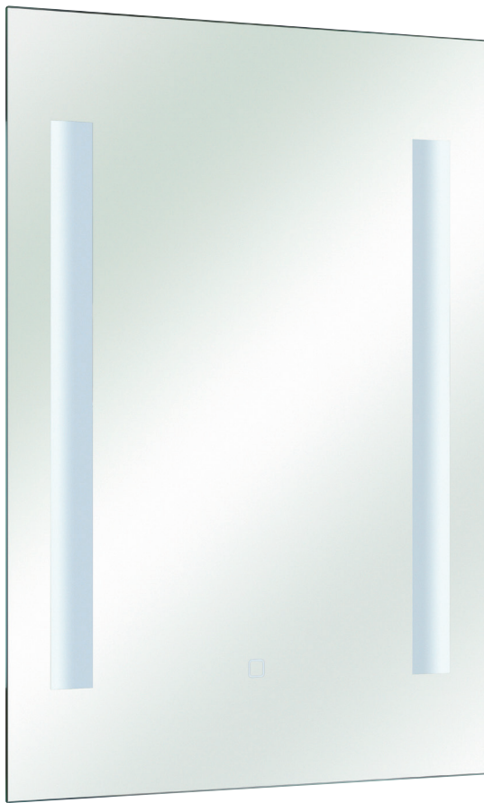
Spiegel 20 inkl. Touchsensor, 12 V LED, 8 W, 460-620 Lumen