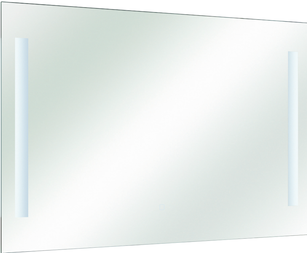
Spiegel 20 inkl. Touchsensor, 12 V LED, 8 W, 460-620 Lumen